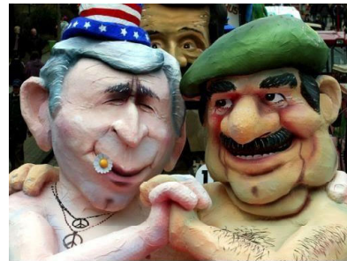
Karneval, Germany 2003.

■ President Bush, March 17: "And it [Saddam Hussein's regime] has aided, trained and harbored terrorists, including operatives of al Qaeda." President Bush, March 6: "He [Saddam Hussein] has trained and financed al Qaeda-type organizations before, al Qaeda and other terrorist organizations." According to several polls, a majority of the U.S. public still believes that there is an Iraq link to 9-11.